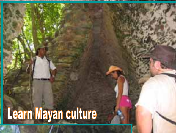
Learn Mayan culture