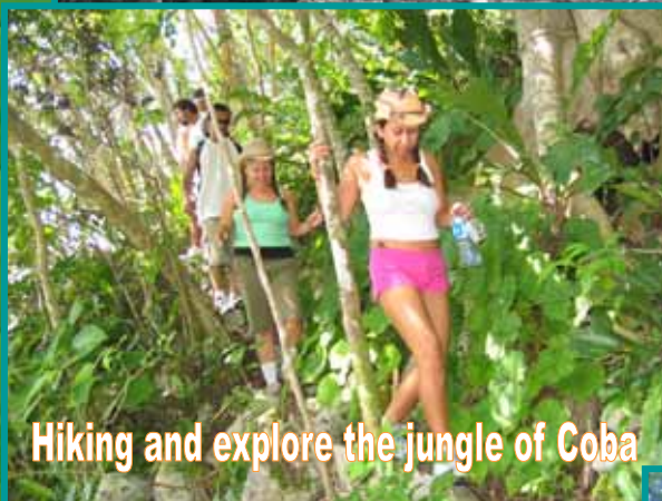
Hiking and explore the jungle of Coba