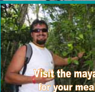
Visit the mayan family and prepare your own tortillas for your meal, besides our guide explains how local people use the tropical plants