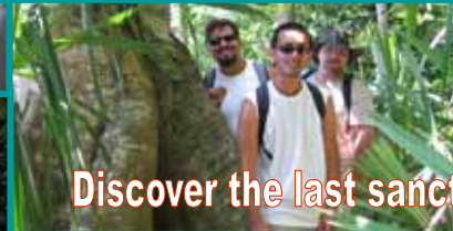
Discover the last sanctuaries to see the spider monkeys