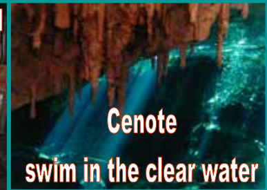
Cenote swim in the clear water